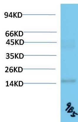
Western blot analysis of Human Serum using TTR (TDY704) Mouse mAb diluted at 1:2000.