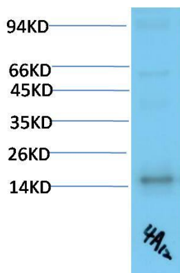
Western blot analysis of Human Serum using TTR (TDY698) Mouse mAb diluted at 1:2000.

Applications: WB-Western blot IHC-Immunochemistry IF-Immunofluorescence IP-Immunoprecipitation ChIP-Chormatin Immunoprecipitation Reactivity: H-Human R-Rat M-Mouse Mk-Monkey Dg-Dog Ch-Chicken Hm-Hamster Rb-Rabbit Sh-Sheep Pg-Pig Z-Zebrafish