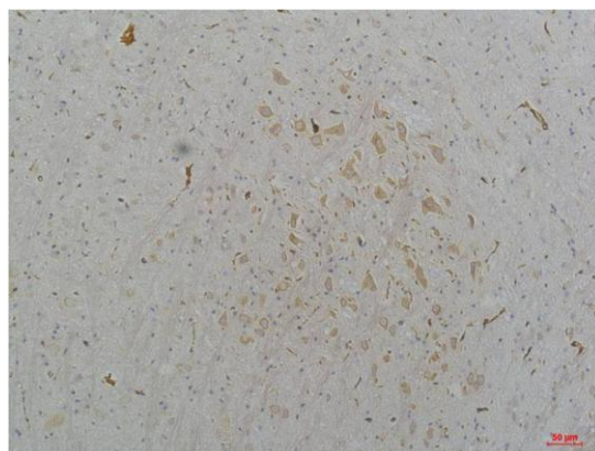
Immunohistochemical analysis of paraffin-embedded Mouse Brain Tissue using Cav2.2 (TDY511) Rabbit pAb diluted at 1:200.